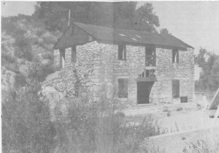
LANDMARK AT CAMPO- IS THIS STURDY OLD STONE STORE THAT PLAYED AN IMPORTANT PART IN THE COUNTY'S HISTORY. PICTURESQUE CAMERA STUDY BY ALPINE'S NOTED PHOTOGRAPHIC ARTIST WHOSE MANY PICTURES HAVE APPEARED IN THE SUN.